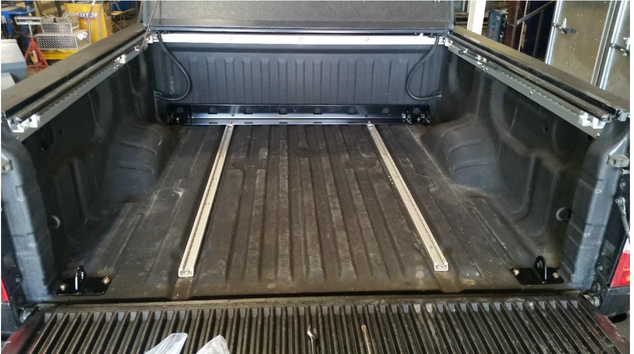
View of installed OEV tie down system

The use of a rubber floor mat under the camper is required, this protects your investment into your truck, and your camper. Overland Explorer is not responsible for any damage to your vehicle or your camper if mounted any other way than specified.