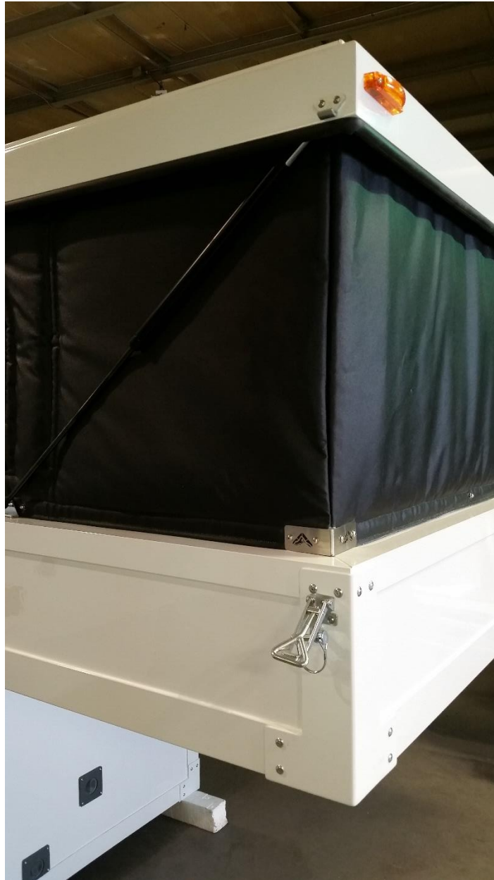
Roof in raised position

140-8319 Chiles Industrial Avenue, Red Deer, Alberta, Canada, T4P 1H2 403-346-9199