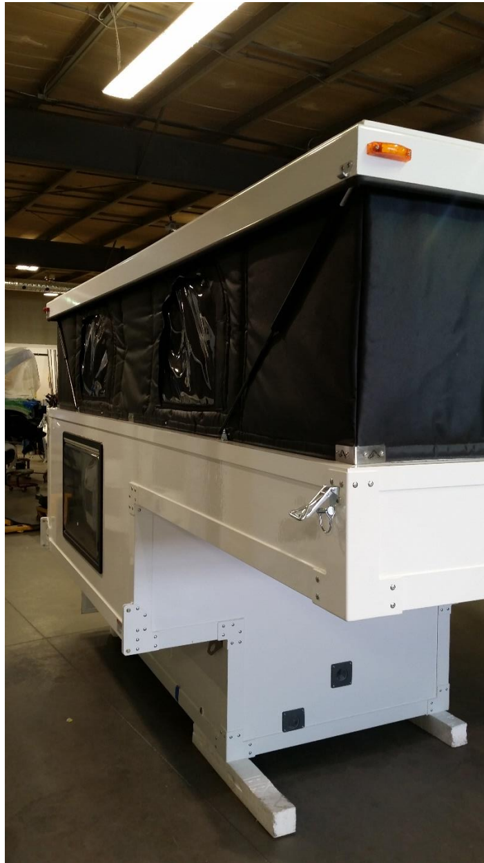
Roof in raised position, you can see that battery box vents in this picture.

140-8319 Chiles Industrial Avenue, Red Deer, Alberta, Canada, T4P 1H2 403-346-9199