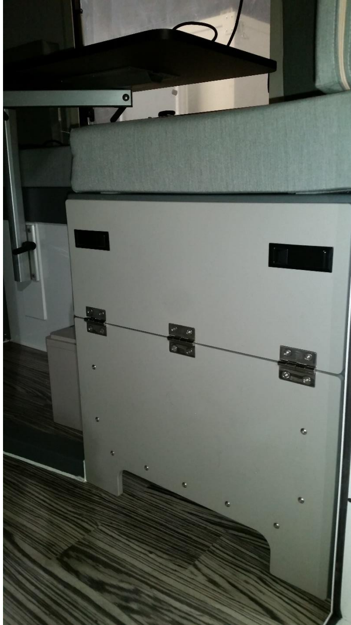
Toilet cabinet in closed position

The dinette cabinet at the rear of the camper near the door has an access door and a sliding tray for a porta potti. The cabinet can also be used for other storage if that function is not required or desired.