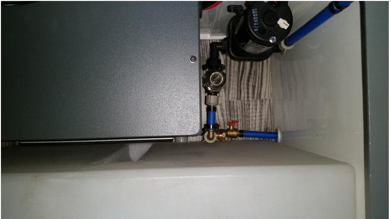
Top view shows fresh water drain, and strainer, and winterizing valve.

The water tank is located under the dinette seat cushion. The level is visible by looking through the level indicating slots in the front access panel. The water tank is filled at the utility connection point on the drivers' side of the camper. A locking cap for the filler is standard equipment for your security. The drain for the water tank is located between the tank and the pump, and the drain point could be on the left- or right-hand side at the front of the camper. There is a winterizing valve also located between the tank and the pump.