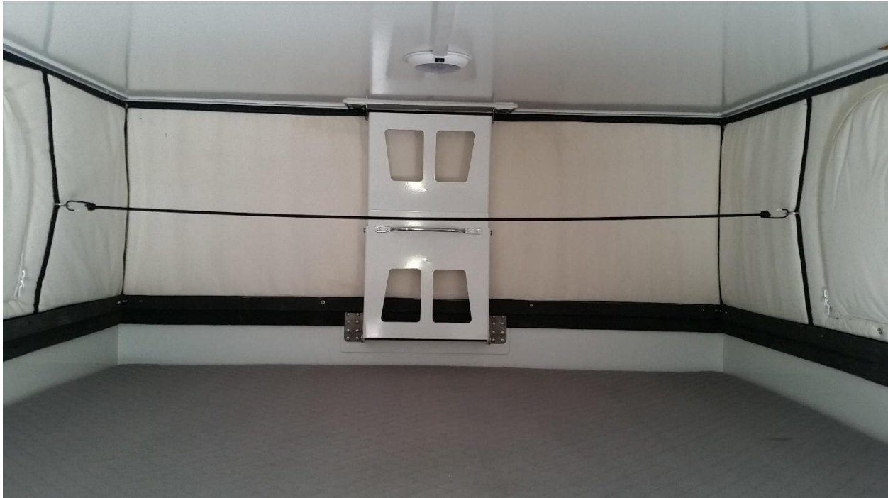
Bungee cords installed; they start the folding process for the soft wall.