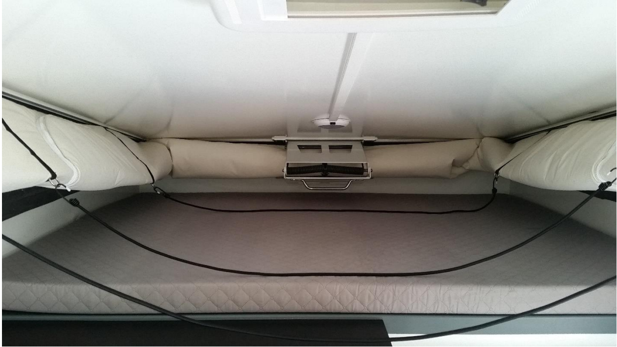
Front hinge down, bungees slack, top folded in.