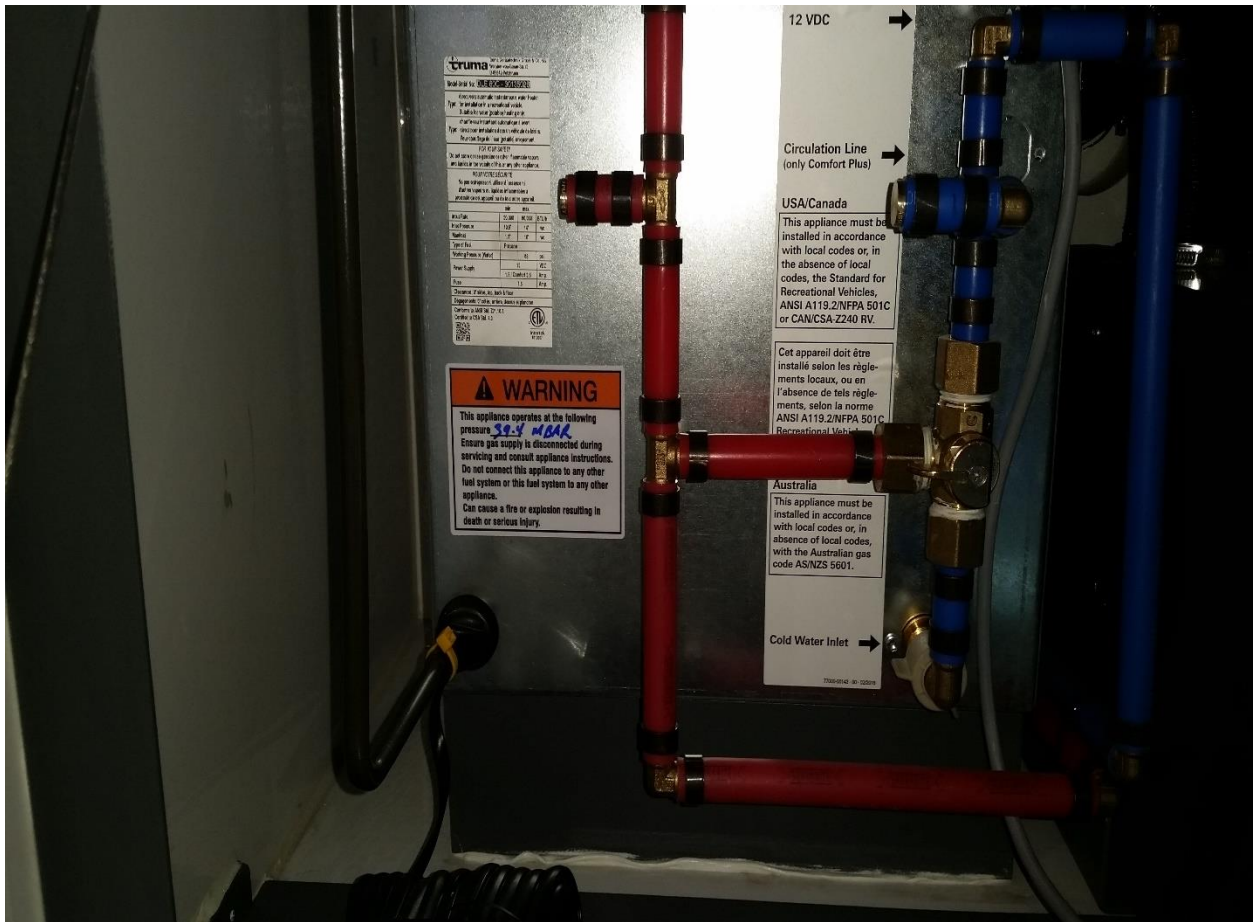
Utility cabinet contains Truma AquaGo hot water heater and Truma VarioHeat, as well as bypass valve and access to fuse block

140-8319 Chiles Industrial Avenue, Red Deer, Alberta, Canada, T4P 1H2 403-346-9199