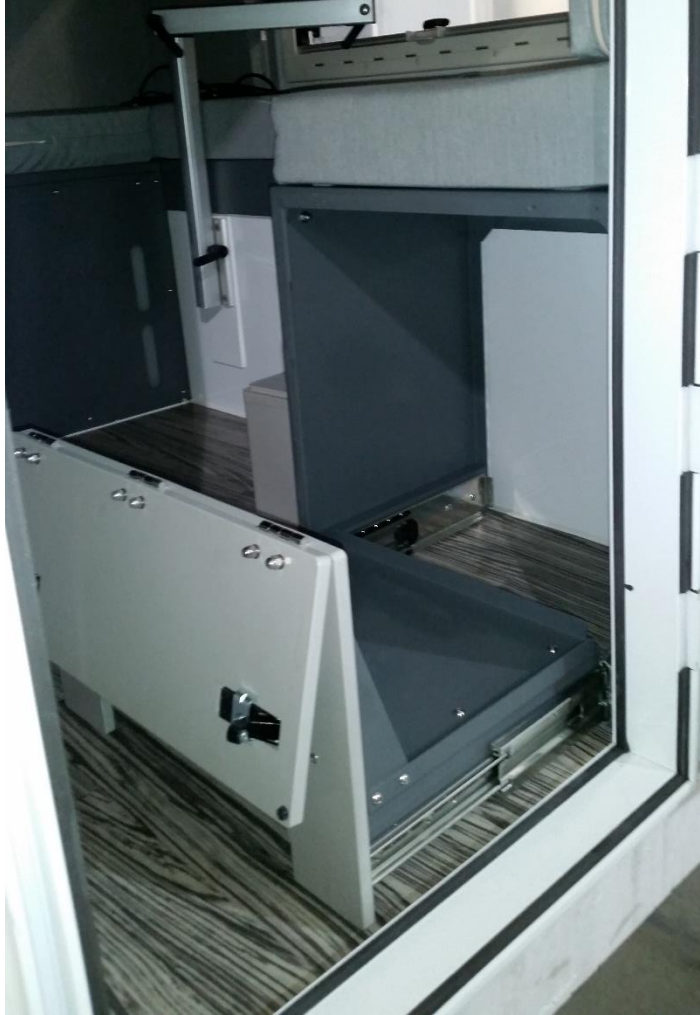
Toilet cabinet in open position

140-8319 Chiles Industrial Avenue, Red Deer, Alberta, Canada, T4P 1H2 403-346-9199