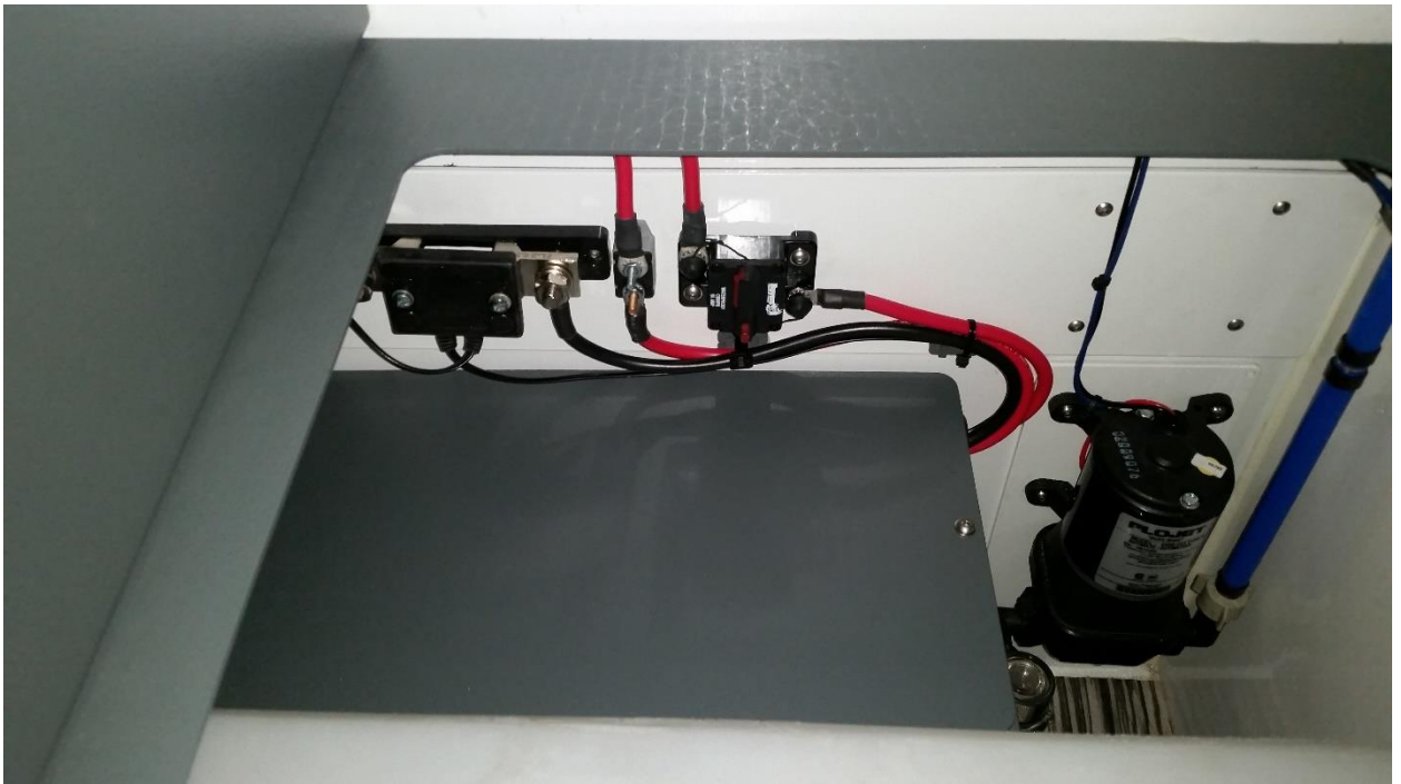
Battery box, water tank, water pump, tank drain, strainer, DC main resettable breaker, located under front dinette seat

https://www.redarc.com.au/Content/Images/uploaded/Manuals/BMS1230S2%20Instruction%20Manual.pdf